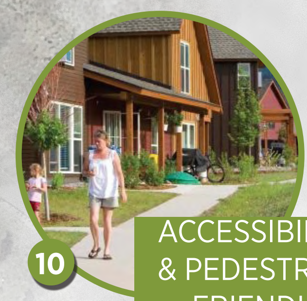
10 ACCESSIBILITY & PEDESTRIAN FRIENDLY