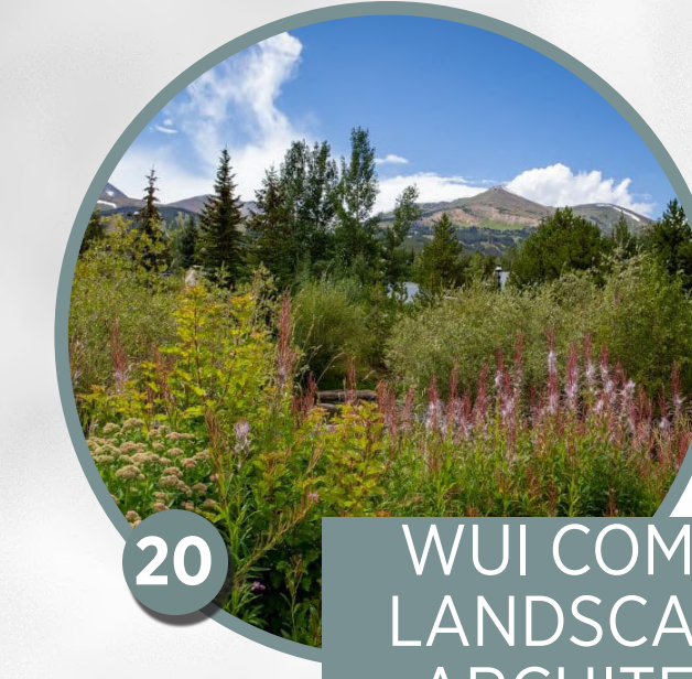
20 WUI COMPLIANT LANDSCAPE AND ARCHITECTURE