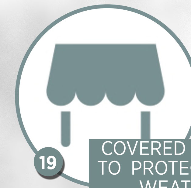
19 COVERED ENTRIES TO PROTECT FROM WEATHER