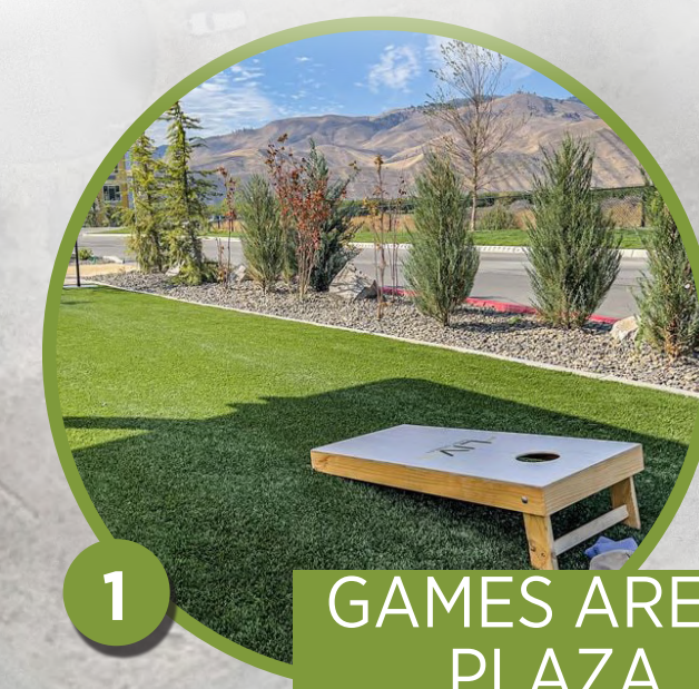
1 GAMES AREA/ PLAZA