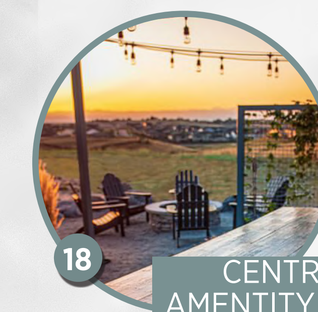
18 CENTRAL AMENTITY SPACE