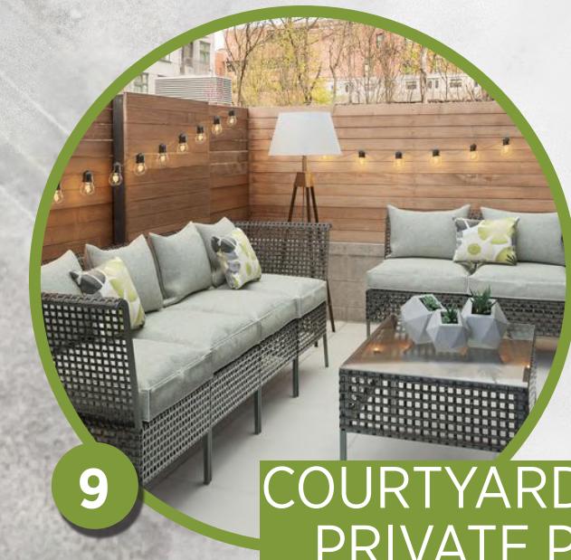
9 COURTYARDS WITH PRIVATE PATIOS