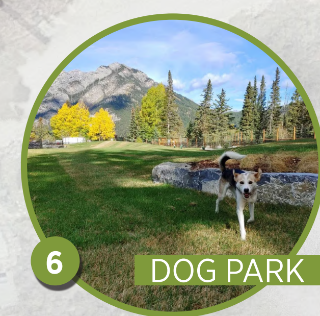
6 DOG PARK