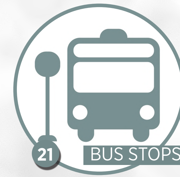
21 BUS STOPS