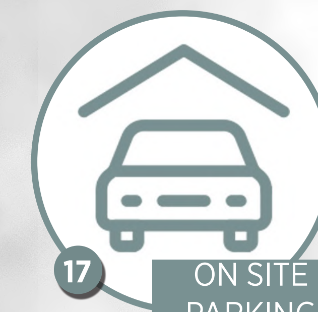
17 ON SITE PARKING