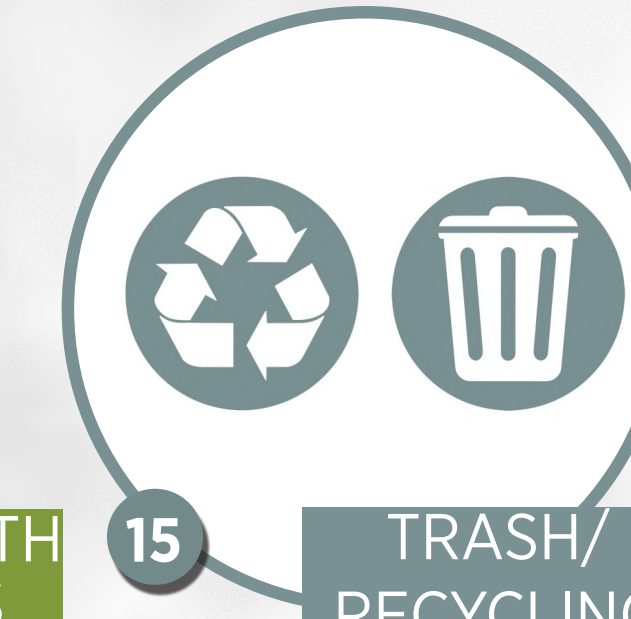
15 TRASH/ RECYCLING