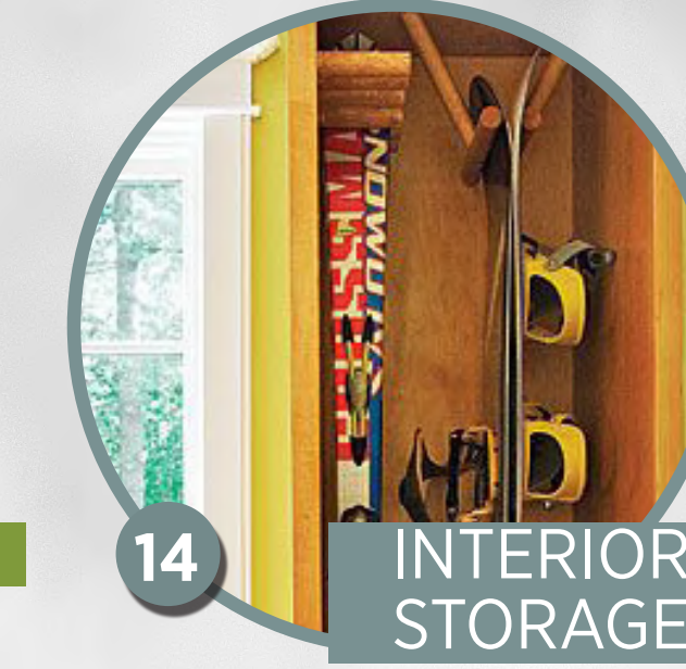
14 INTERIOR STORAGE