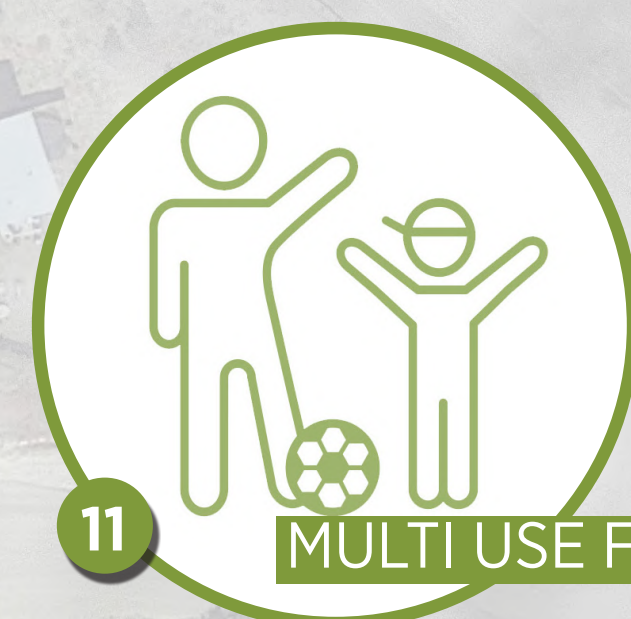
11 MULTI USE FIELD