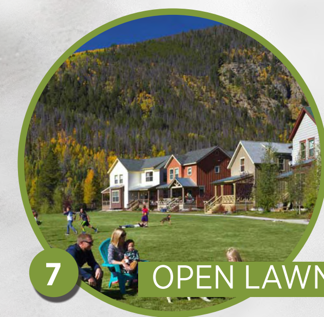
7 OPEN LAWN