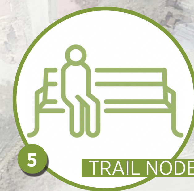
5 TRAIL NODES