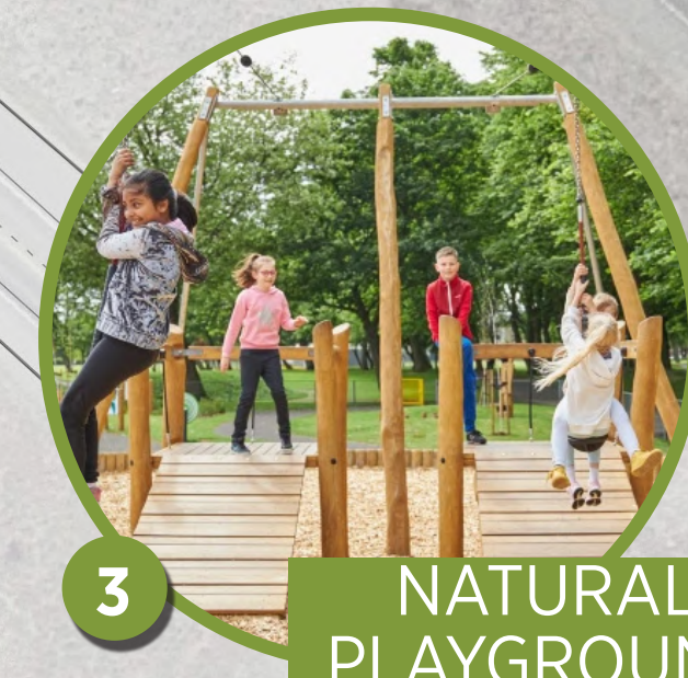
3 NATURAL PLAYGROUND