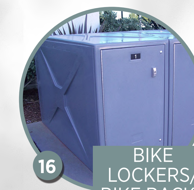
16 BIKE LOCKERS/ BIKE RACKS