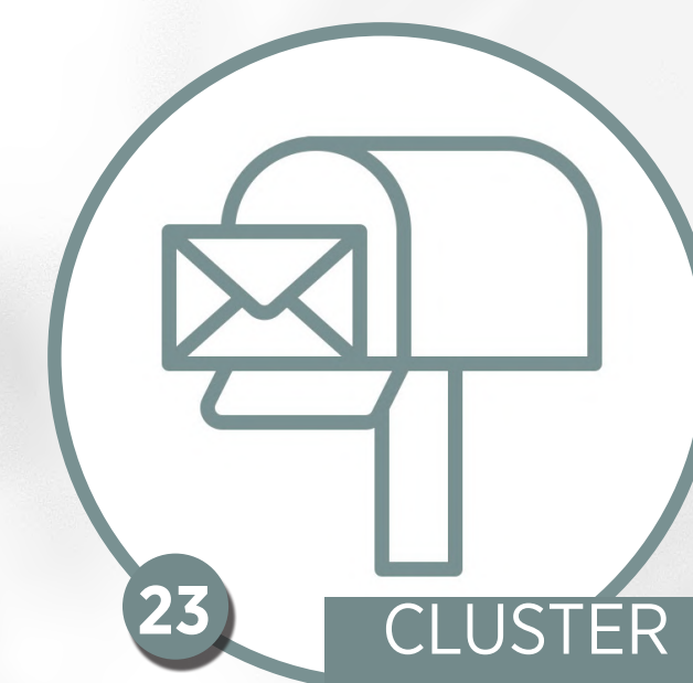
23 CLUSTER MAILBOXES