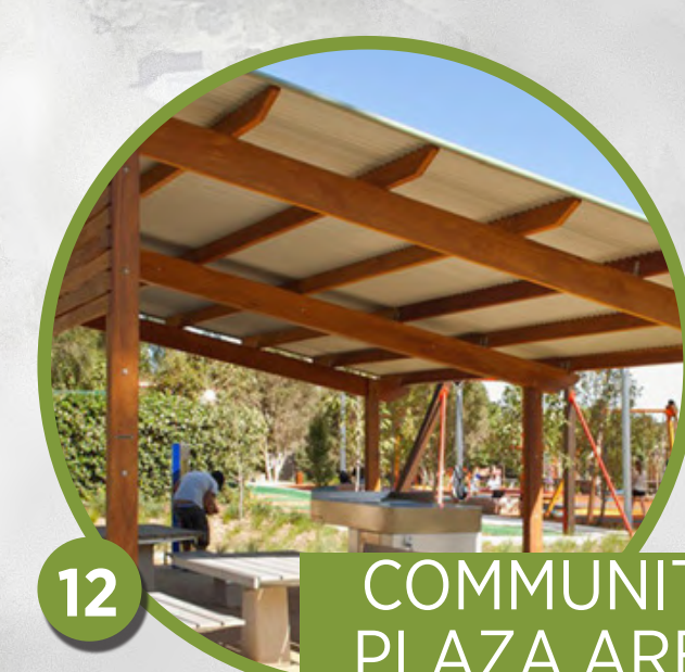
12 COMMUNITY PLAZA AREA