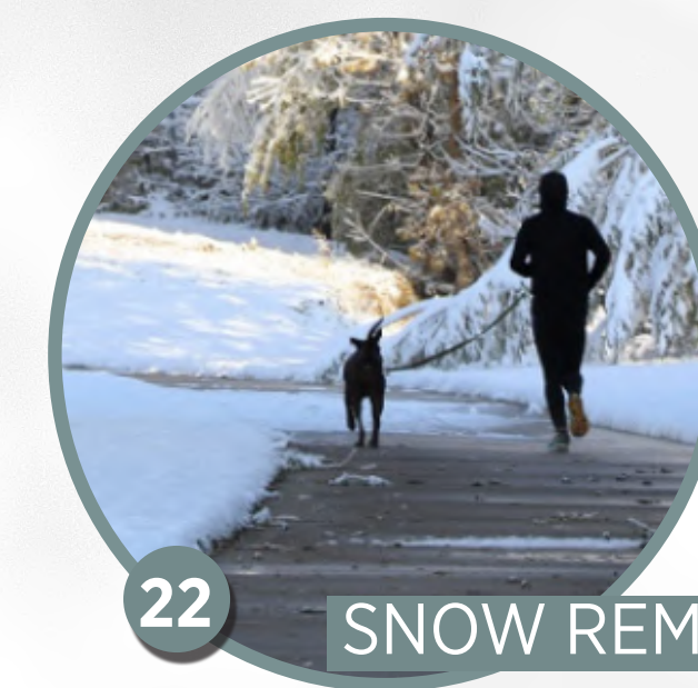
22 SNOW REMOVAL