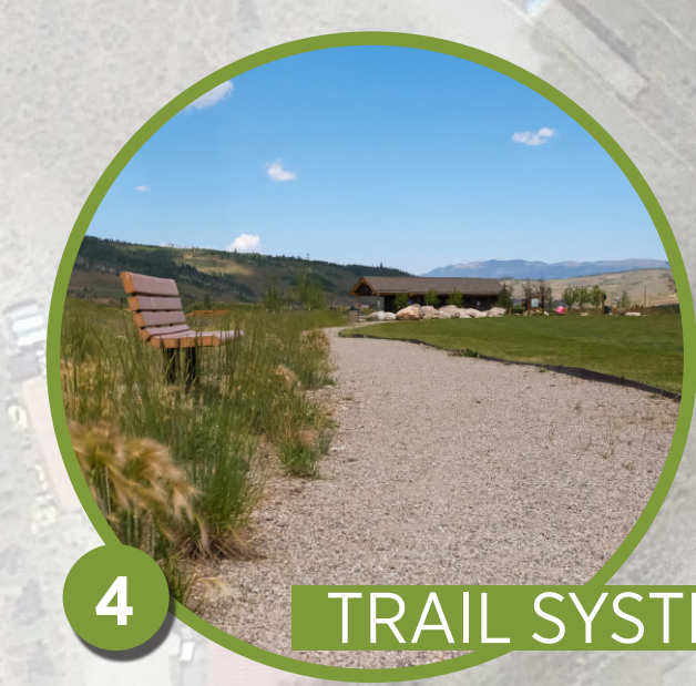
4 TRAIL SYSTEM