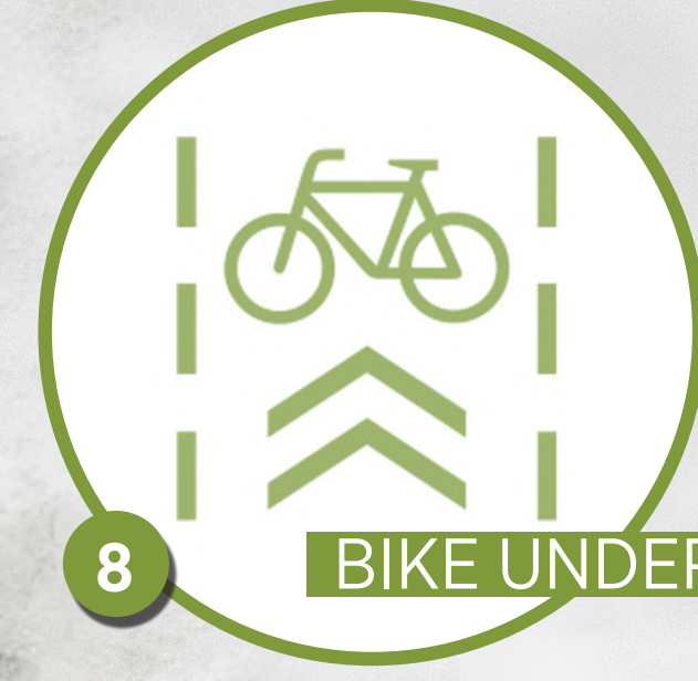
8 BIKE UNDERPASS