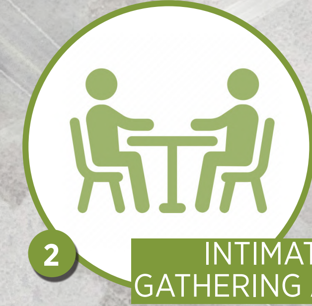
2 INTIMATE GATHERING AREAS